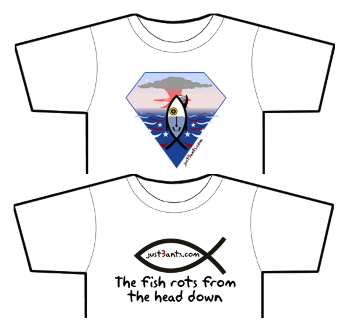
Perfect for 4<sup>th</sup> of July Celebrations?

Any actions you take to bring more Public International Attention to our just cause, and lets not even talk about say a nominal "pay your dues" donation, would be supporting your gravy train ending that much sooner, which has you constantly playing this "What If?" game which goes as follows: