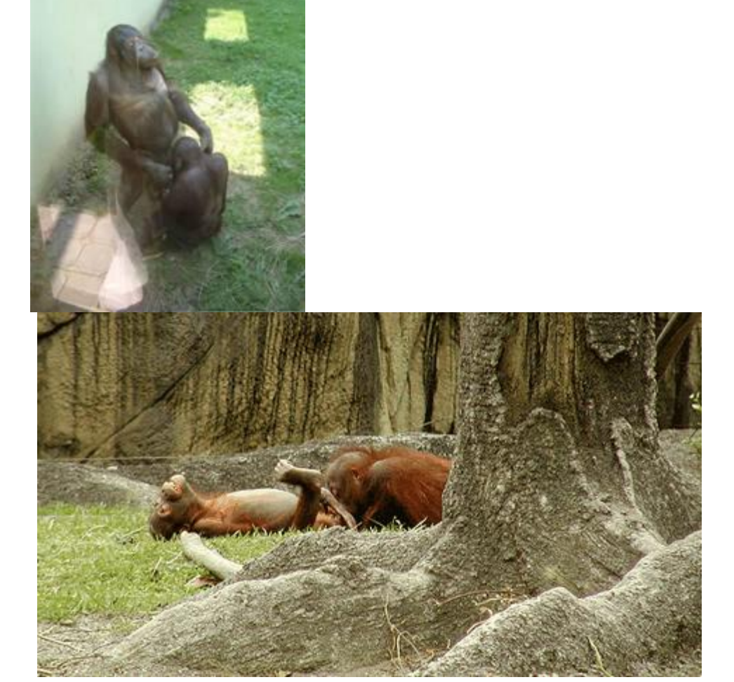
My F-C and most brilliant logical thinker wife gets its!

You would agree, that for the vast majority who have their basic needs met, there is very little left for them to talk about except for getting laid.