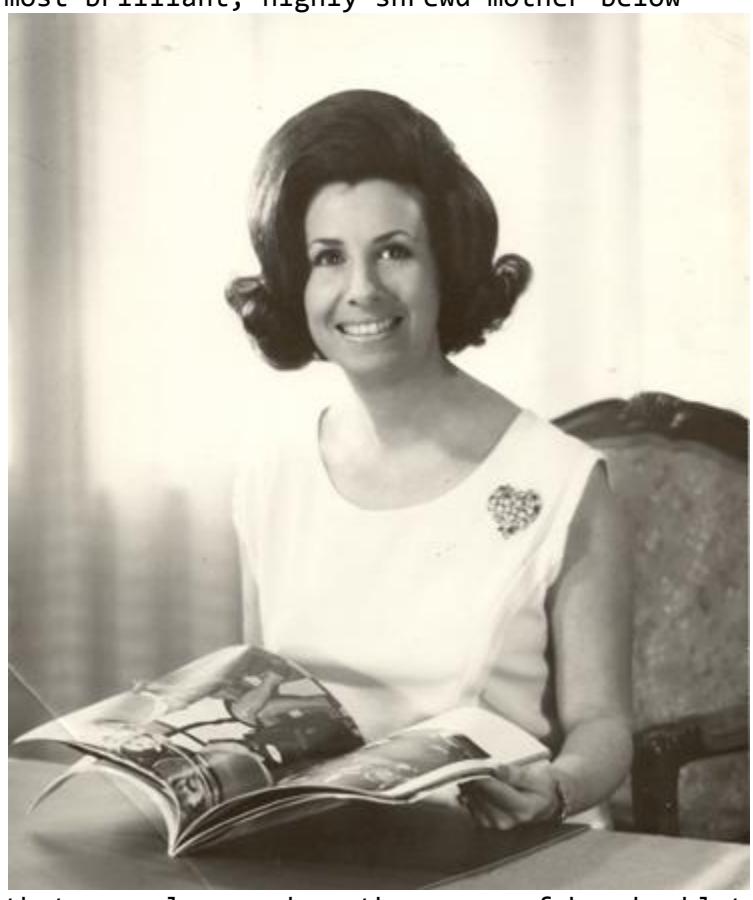
that was also used on the cover of her booklet, THE IMPORTANCE OF BEING A WOMAN

It is possible that you haven't previously seen a most often used photo of my most brilliant, highly shrewd mother below